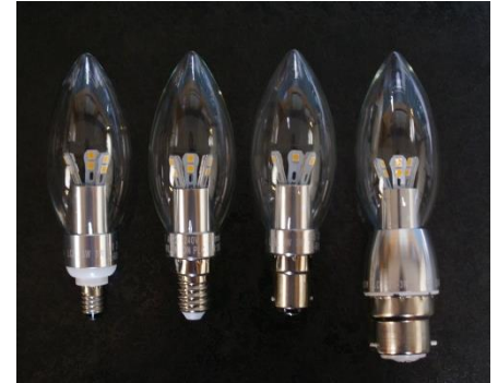
3w above and 7w below